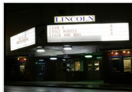
The Lincoln Theater in Port Angeles, which figures in the books, will host the local movie premiere.