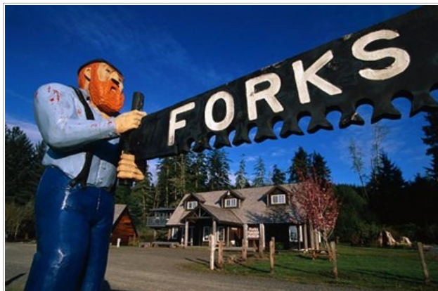
Forks, Wash., once a lumber town, is becoming a 'Twilight' town.

If Forks' favorite vampire-human couple decided to make a movie date out of the "Twilight" premiere on Nov. 21, where would they see the show? The misty, one-stoplight town where they fell in love doesn't have a cinema.