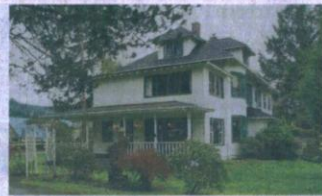
MILLER TREE INN

Now, it's Twilight time again, and here's what you'll find on your Twilight -themed vacay to Forks. Entering town, you'll see the "Welcome to